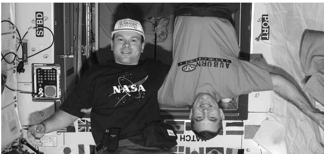
NASA Astronauts share a friendly moment onboard the International Space Station's U.S. laboratory Destiny.

All who have completed our Summer Reading Club will receive a ticket to this program.