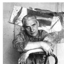
Willem de Kooning

Focusing on the life, art, and inspiration of the abstract expressionist Willem de Kooning, teens will have an opportunity to explore the world of abstract art. Each teen will paint their very own masterpiece using high-end materials and canvases. This program is provided by the Long Island Children's Museum in cooperation with the Willem de Kooning Foundation.