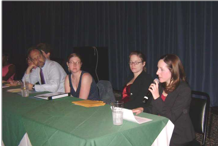
Young Adult Librarians talk about various innovative programs that they have offered at their libraries.

Summer is here! Most YA librarians are busy with their summer reading programs. YNK You Never Know @ Your Library is the theme this year. Forensics, fingerprinting and other mysterious programs are going strong throughout the Island.