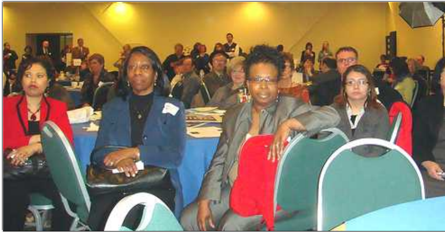
Nassau librarians and support staff attend Library Rally in Albany.