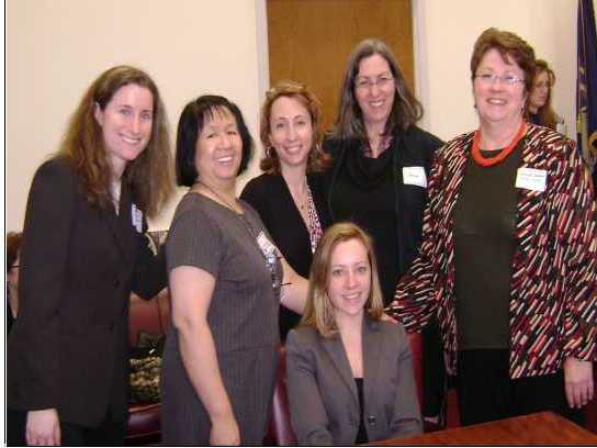
Nassau librarians with Legislative Aide to Senator Dean Skelos.

A large contingent of Long Islanders made the trip to Albany this year for Library Advocacy Day on March 1, 2011. NCLA was represented by more than 70 individuals with a strong group of library supporters joining our advocacy team and traveling to Albany in one of the two NCLA-sponsored buses that made the day-long trip.